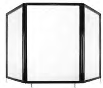
Framed Countertop Shield