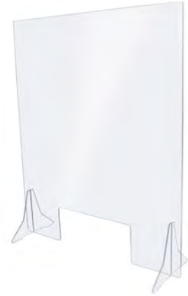
Countertop Shield with Cutout