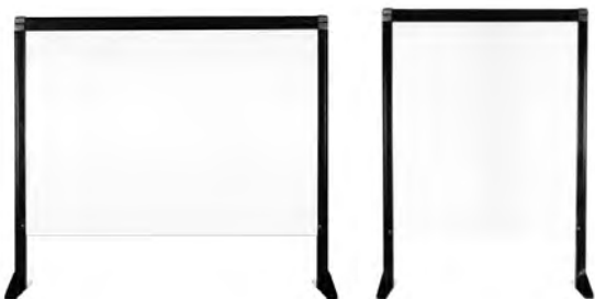
Framed Countertop Single Shield

You can restore the luster of glossy finishes by using lemon oil or high-grade automotive paste wax. Soft Scrub® can also be used to remove scuff marks and scratches.