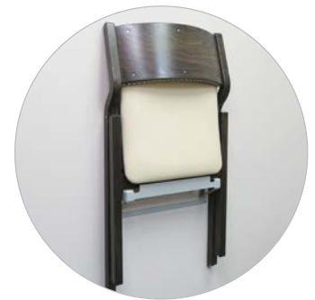
Optional wall mount unit for convenient storage