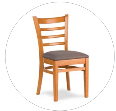
Carole Is Also Available With Upholstered Seat