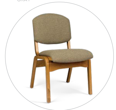
Campus 4 Customizable With Upholstered Back & Seat Options