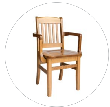
Bulldog Arm Chair Also Available