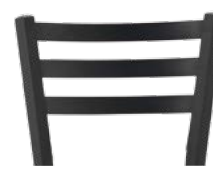
METAL LADDER-BACK (3)