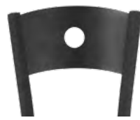
WOOD OR METAL CIRCLE BACK