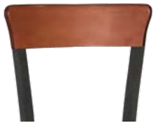
WOOD 1 SLAT