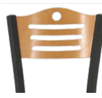
WOOD SLAT CIRCLE BACK