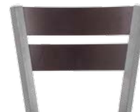
WOOD 2 SLAT