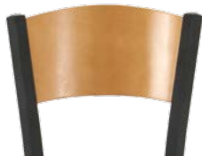
SMALL SOLID WOOD