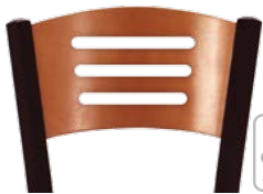
WOOD 3 SLOT