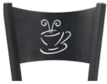
METAL COFFEE CUP