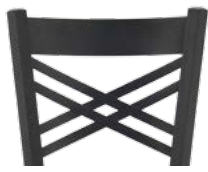
METAL X BACK