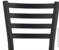
METAL LADDER-BACK (4)