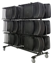
Folding Chair Tree Cart