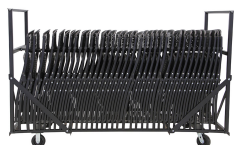
Folding Chair Cart - Stacking