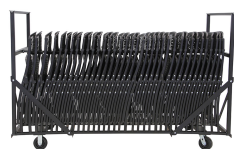
Folding Chair Cart - Stacking