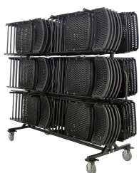
Folding Chair Tree Cart