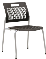
Adapt Stacking Chair