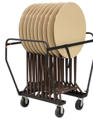
CT Cart - X Leg