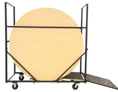
CT Cart - Stacking