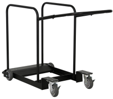
CT Cart - Edge