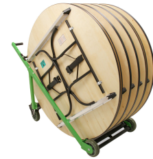
XpressPort Round Table Cart