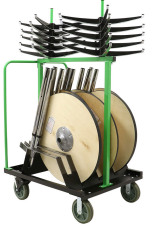
XpressPort Cocktail Cart