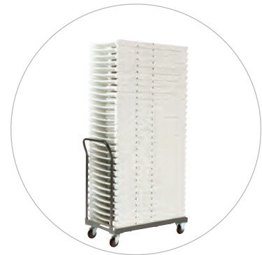
Duramax™ Pro Stacks up to 30 Chairs High