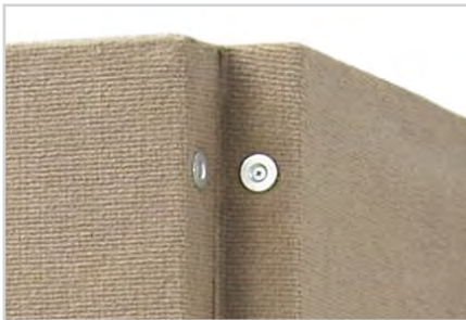
Magnetic End Connections

The magnetic end connections allow you to attach multiple panels together, end-to-end, which gives you more versatility and flexibility in setting up. There are two round, 1-inch diameter chrome magnets installed on each end of the panels. The magnets are polarized, one side with negative magnets and one side with positive magnets. Positive magnets will have a small sticker labeled with a “+” symbol. In order to connect two panels successfully, you must match the positive side of one panel to the negative side of another panel.