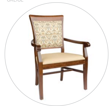
Bariatric Arm Chair Also Available