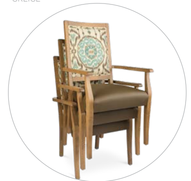
The Easton Arm Chair Stacks 3 High