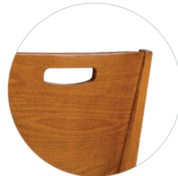
York's Hand Cut Out Provides Ease of Moving

Fabric amount is estimated using 54" (137cm) wide material. The actual amount required may vary depending on special pattern matching and the width of material. Specific yardages for orders can be provided upon request with model, quantity and fabric details. Customer is responsible for any additional customs/duties fees for fabrics shipping across the border.