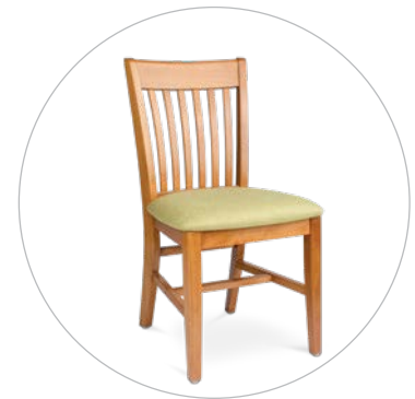
Upholstered Seat Option Does Not Include Side Brackets