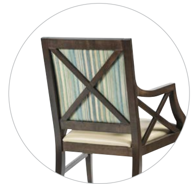
"X" Back and Arm Design