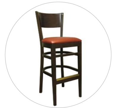
Also Available With Upholstered Cushion Seat