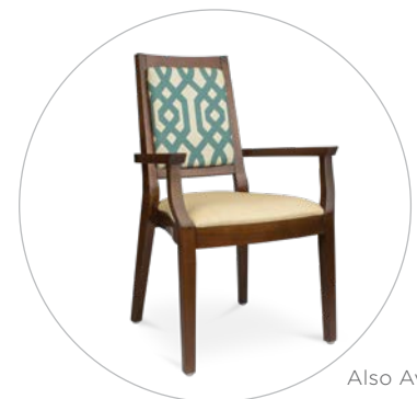
Also Available With Arms