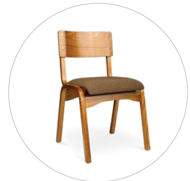
Carlo Chair Also Available with Upholstered Seat