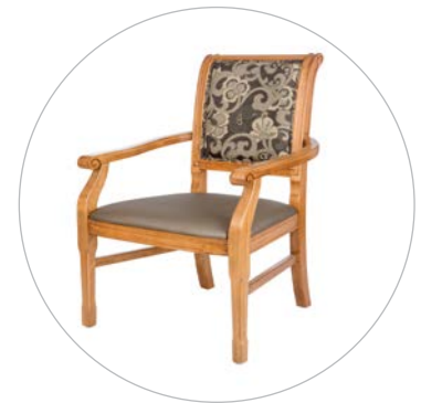
Bariatric Arm Chair Also Available