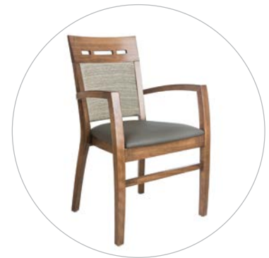
Sussex Arm Chair Also Available