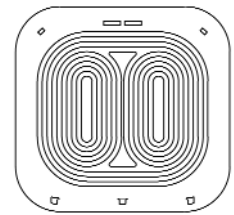
FormFlex Seat Base

Seat: The upholstery and foam are stapled to an injection molded polypropylene seat base. The seat base features concentric oval patterns designed to flex with the weight of the user (patent pending). The seat attaches to the chair via three molded-in front tabs inserted into corresponding attachment points in the steel frame, and four molded-in rear clips which snap around the underside seat support. Foam is 2.5" [6cm] thick high-resiliency 2.8 lb. MDI polyurethane.